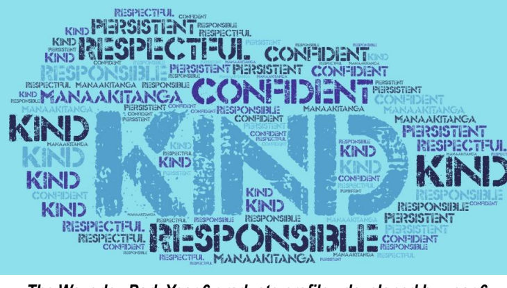
The Waverley Park Year 6 graduate profile - developed by year 6 students and parents

The Waverley Park Maori Leavers profile - developed by whanau.